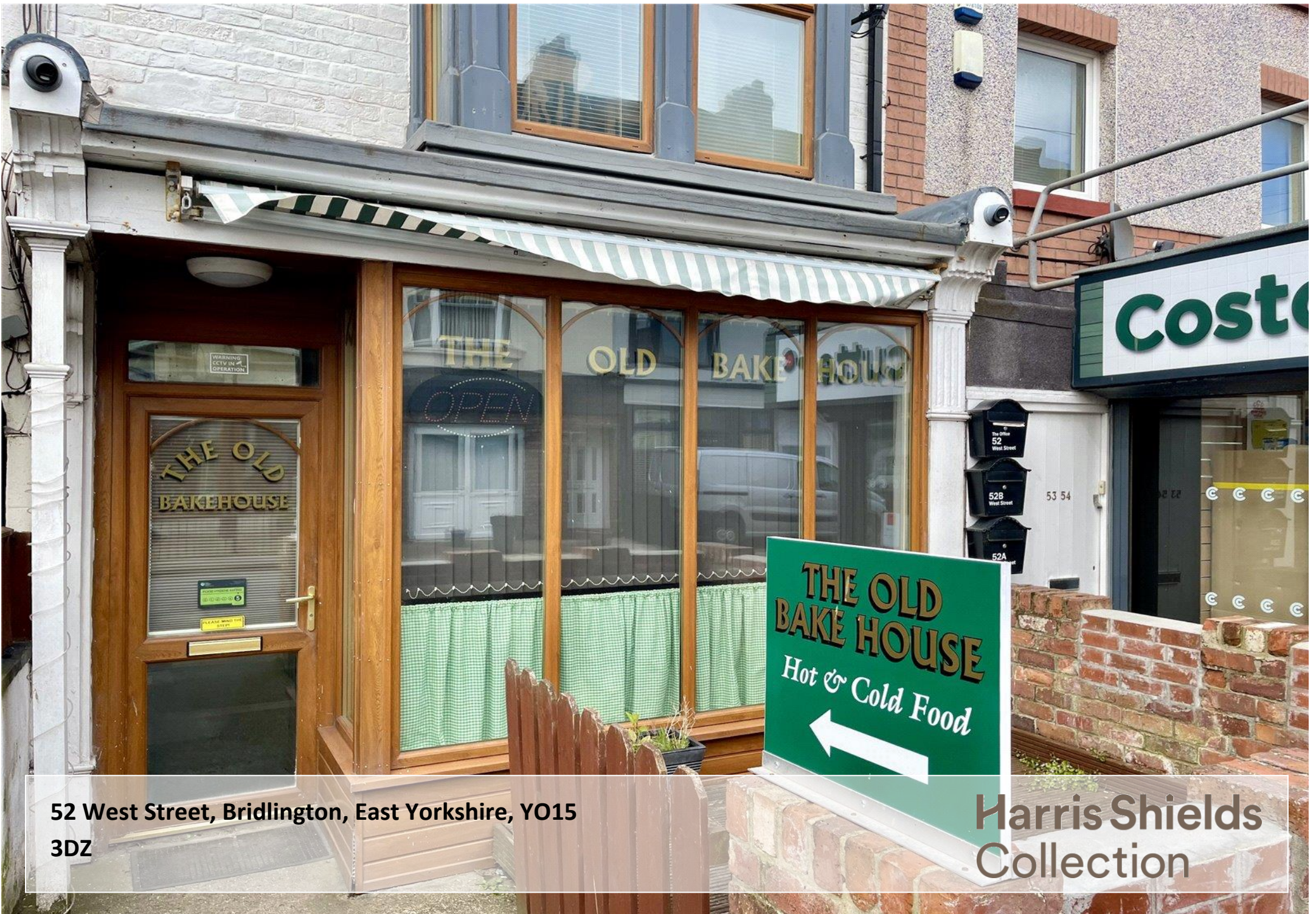
52 West Street, Bridlington, East Yorkshire, YO15 3DZ